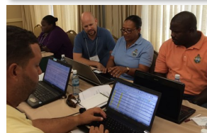
Trainings and Workshops